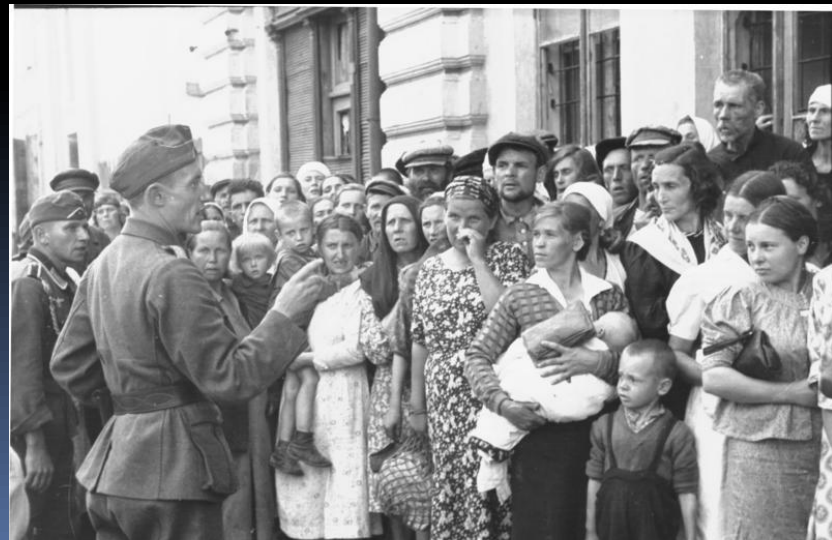
Juli 1941