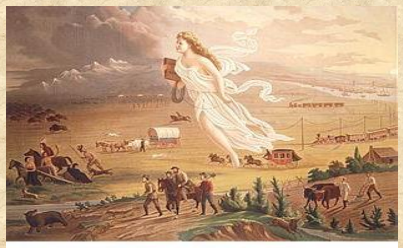
American Progress, 1872 by John Gast