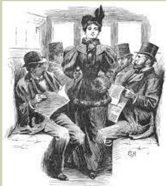
LA BELLE DAME SANS "MERCII."